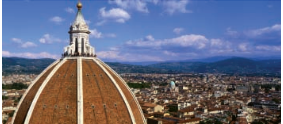
Cathedral of Santa Maria del Fiore, Florence, Italy

Save 10% on all verandah and non-verandah staterooms, and 5% on Penthouse accommodations on all Crystal Serenity European cruises, departing May 19 through September 5 from Rome, Venice, Athens, Barcelona and Monte Carlo. Crystal Society Early Booking Fares* begin at just $2,735 per person, double occupancy. And because you pay in U.S. dollars rather than Euros, you enjoy a greater value. Highlights of the 2008 season include more overnight calls and extended hours in each port, with plenty of time on our seven- to 12-day itineraries to explore the Mediterranean's most sought-after destinations.