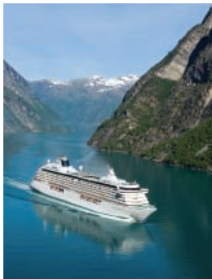
Crystal Serenity in Geiranger Fjord, Norway

And don't forget all of the special luxuries available to you on a Crystal cruise. While traveling through Europe, you'll indulge in an incredible dining experience on board, enjoy Broadway-style entertainment and participate in a multitude of enrichment activities — activities that, if enjoyed during a land-based vacation, would cost thousands of dollars. But, on a Crystal cruise, all of these wonderful amenities are included in your cruise fare.