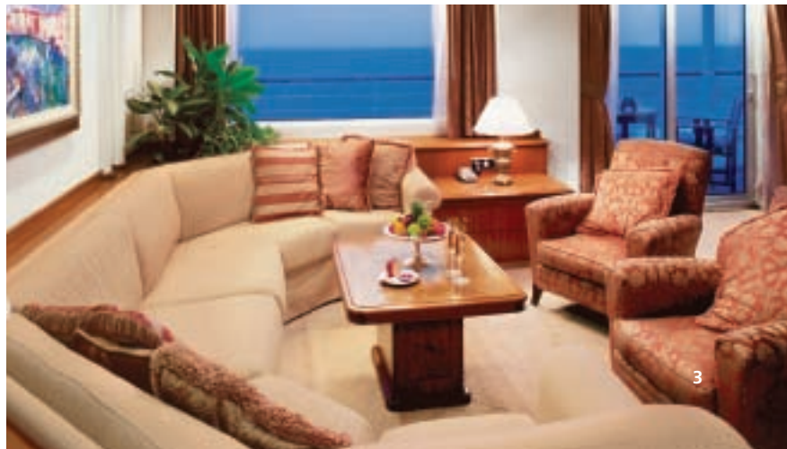
Crystal Penthouse with Verandah